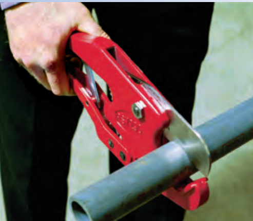
RS7290 Shown on 2" PVC